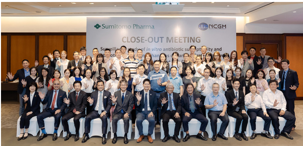
The project on measures against Antimicrobial Resistance (AMR) closing out

The results will be used in clinical settings at participating medical facilities, and will be reported to the Ministry of Health for use in future antimicrobial resistance measures in Vietnam.