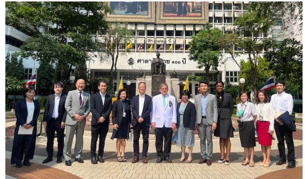
In front of the Faculty of Medicine Siriraj Hospital, Mahidol University

At the Ramathibodi Hospital, a monitoring visit was conducted for the Virtual Reality (VR) study which is a study for treating Major Depressive Disorders using virtual therapy. (Study registration: UMIN000052903)