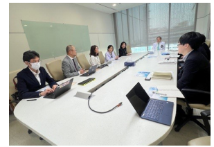
Meeting with SICRES management staff Office