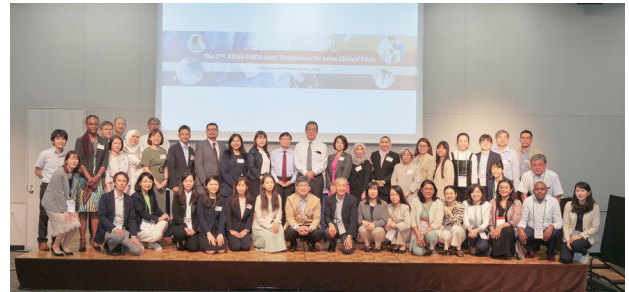
The 2nd ARISE-PMDA joint Symposium for Asian Clinical Trials

The discussion was centered on how academia, regulatory authorities, and industry can work together to address barriers and accelerate FPI for approvals in Asia. The panel concluded with the hope that ARISE will continue to bring regulators, academia, and industry to discuss issues related to clinical trials, as well as to promote regulatory harmonization and accelerate regulatory approvals.