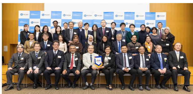
The 2nd ARISE Annual Meeting

The third annual meeting will be held in Bangkok at the Mahidol University, Siriraj Hospital.