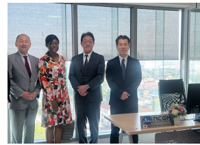
In the NCGM Thailand Collaborating Office