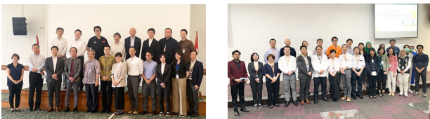
A group photo of SMEDO team: Tokyo Government representative, NCGM team and 10 Japanese medical device company representatives with Siloam Hospitals Group Executives (left) and with University of Indonesia Teaching Hospital (right).

Tokyo Government initiated SMEDO project to introduce medical products developed by small-middle